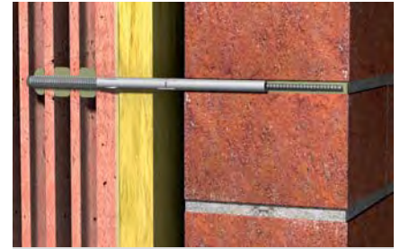
Detail: Repairing outer leaves