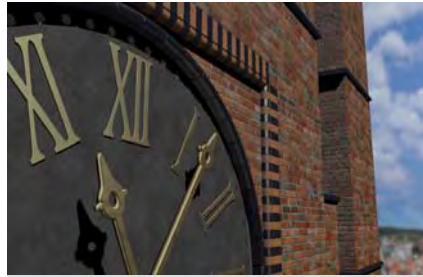
Repairing outer leaves